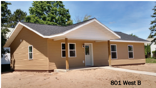
801 West B